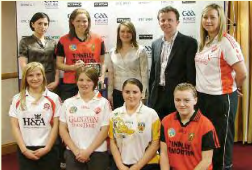
Players and officials at the joint launch in the Ramada Hotel