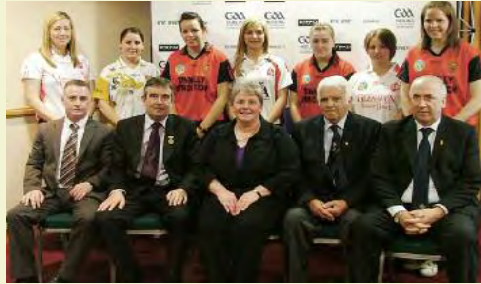
Players and officials at the joint launch in the Ramada Hotel

The combined launch of the Ulster Senior Hurling & Ulster Senior & Junior Camogie Championships took place recently at the Ramada Hotel Belfast. For the second year in a row the Provincial 'small ball' family held a joint launch.