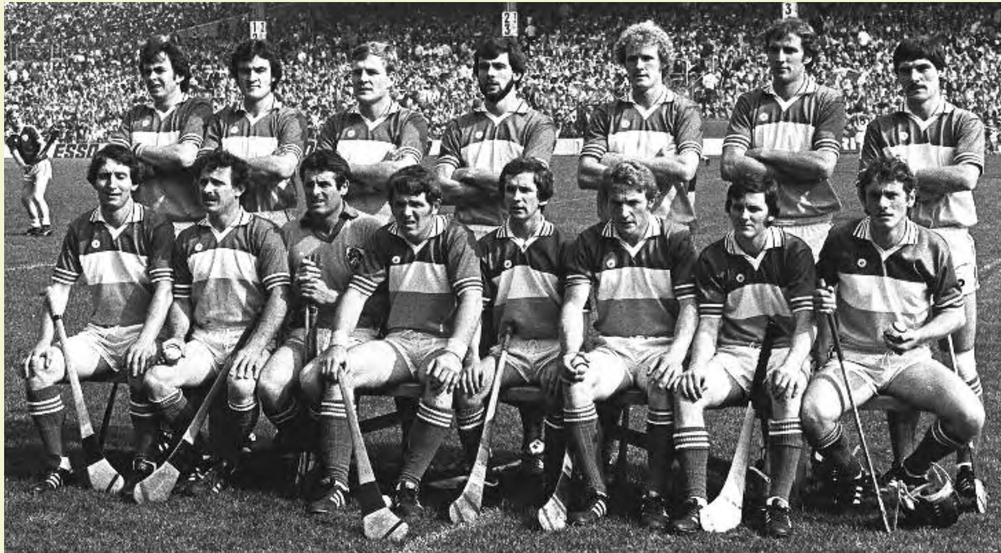
Above: OFFALY-ALL-IRELAND HURLING CHAMPIONS 1981